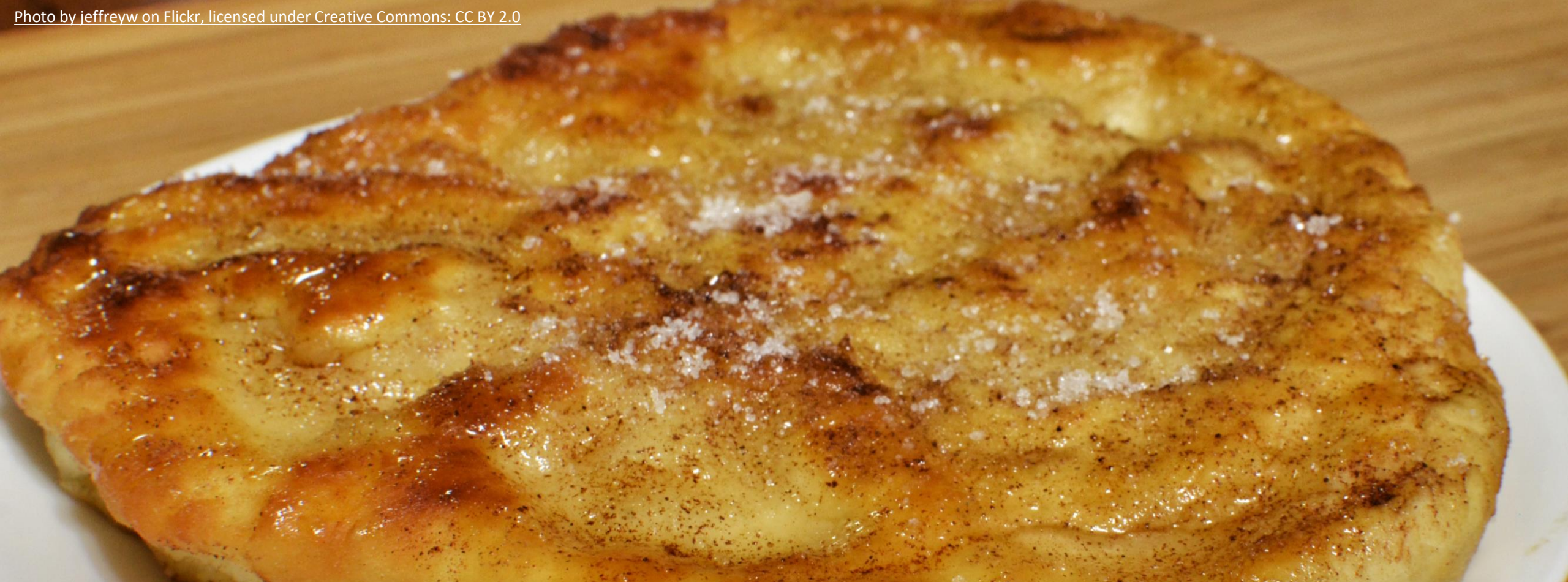
Bannock (Fry Bread)