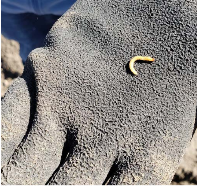
Figure 1. Wireworm collected from Richmond, BC

Aeolus , Agriotes , Ctenicera , Dalopius , Limonius , and Melanotus (Vernon and van Herk, 2013). Wireworms of the Aeolus spp., Melanotus spp. and Limonius spp have been known to target turnip plants (Penn State University).