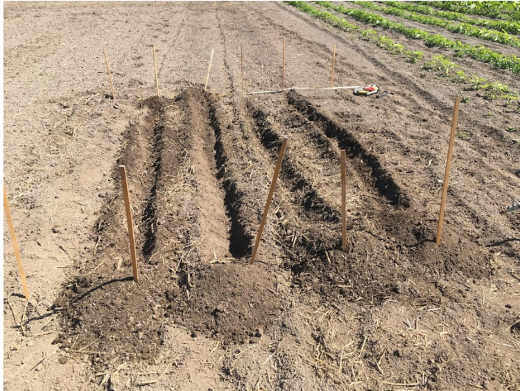
Figure 4. Application of Metarhizium brunneum in block 4.

planting. The late planting was seeded on August 20. On September 23, a single potato tuber without wireworm feeding holes was dug into the centre of each plot, 25 cm deep to help measure wireworm pressure.