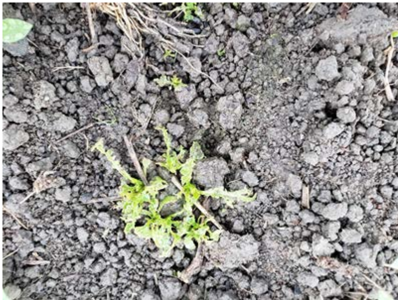
Figure 6. Flea beetle damage to turnip plants.

Turnip germination was poor throughout this study, even after the early planting was reseeded. The first treatments of M. brunneum and DSM were applied three days before the southern coast of British Columbia suffered a heat dome, with temperatures reaching almost 40°C in Richmond. The first early planting was seeded shortly after the heat dome. As shown in table 3, temperatures in July and August were high, with a mean temperature of 19.4°C, almost two degrees higher than average (Environment Canada, 2021). Germination from the August 2 and August 20 plantings were also sporadic in certain plots. High nightshade, thistle, and purslane weed pressure, and flea beetle damage (Figure 6) contributed to poor turnip growth in the eastern plots