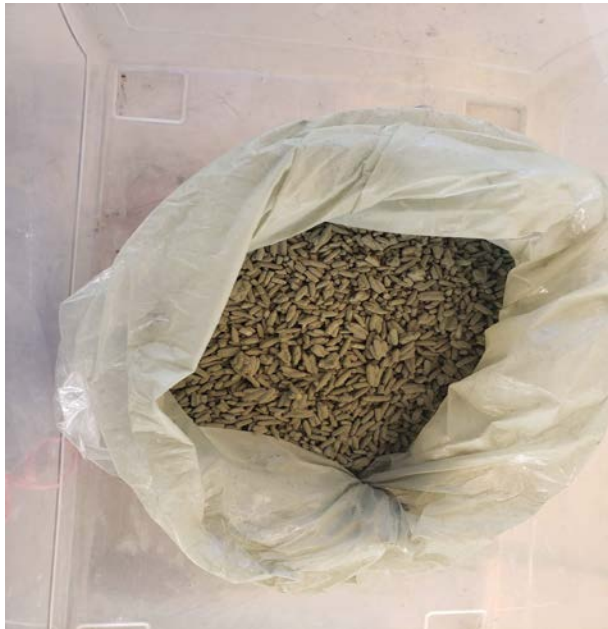
Figure 3. Metarhizium brunneum before combined with rolled oats.

The defatted seed meal was applied at 1.3 \text{ kg/m}^2 , coming to 11.5kg per plot. Hakurei turnips seeds were purchased from West Coast Seeds and planted in 10 rows per plot.