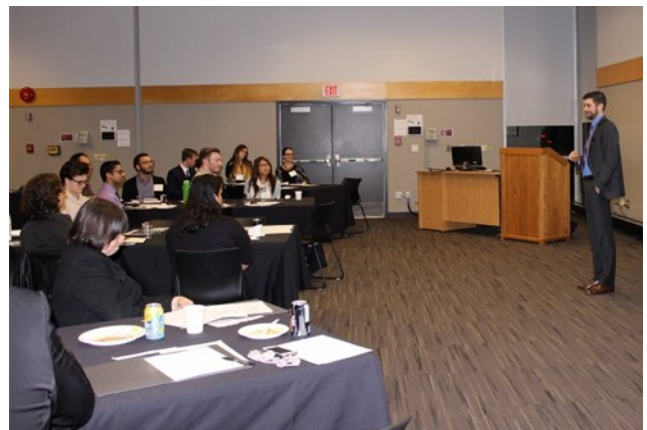
KPUAA's Professional Development Workshop March 31, 2016