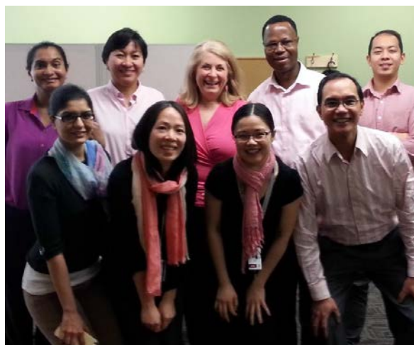
IAP Team supporting Pink Shirt Day

Executive Director, Institutional Analysis & Planning