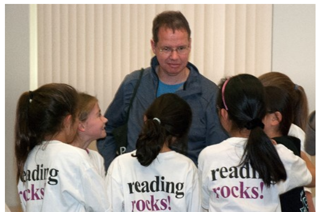
The victorious Winning Wonders from Port Coquitlam sporting their Reading Rocks! t-shirts.