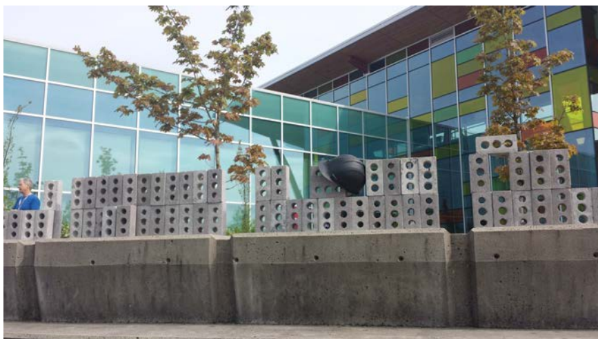
KPU Tech students create installation featuring 122 bricks, representing the 122 lives lost on the job in B. C. in 2015