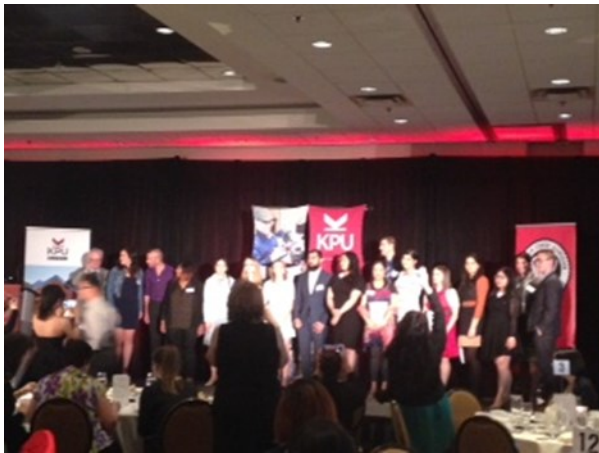
KPU Student Leadership Awards—April 28, 2016