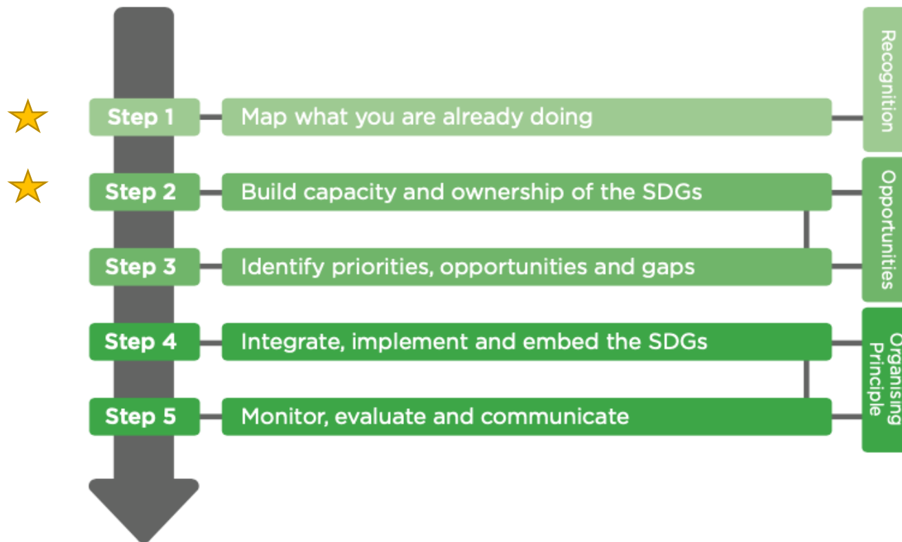
Figure 3: Overview of the step-by-step SDG integration process.