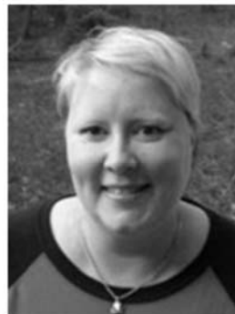
Cathleen With fiction, young adult fiction cathleenwith.ca