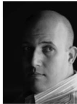
Billeh Nickerson poetry, spoken word, creative nonfiction, business of writing billeh.com