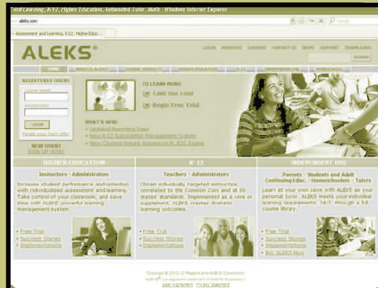
ALEKS LOGIN PAGE