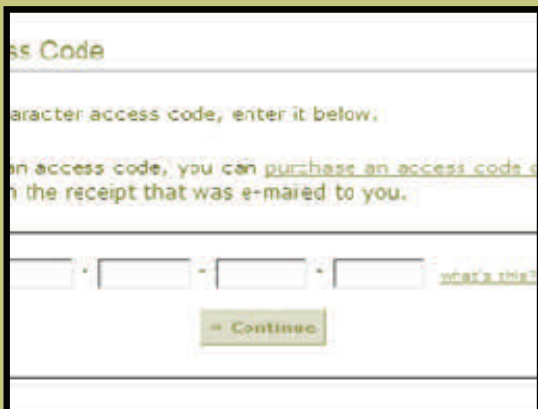
PURCHASE CODE PAGE