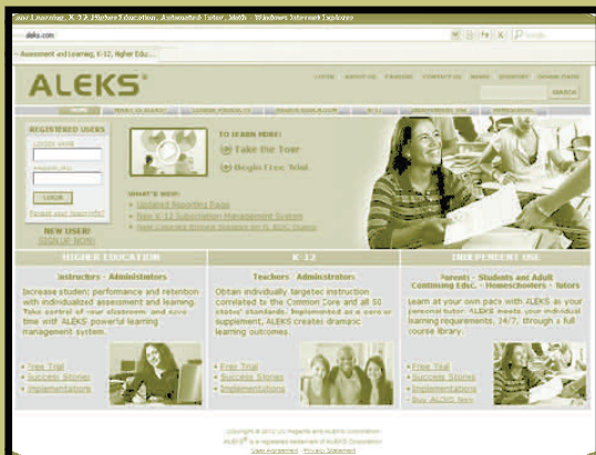
ALEKS HOME PAGE

Gear up! ALEKS Bridge to Electrical Foundations