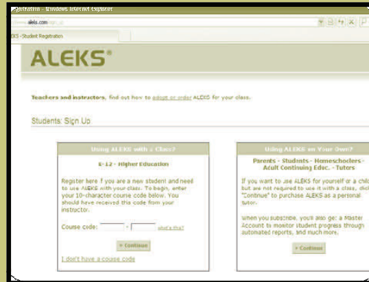
STUDENT SIGN UP PAGE