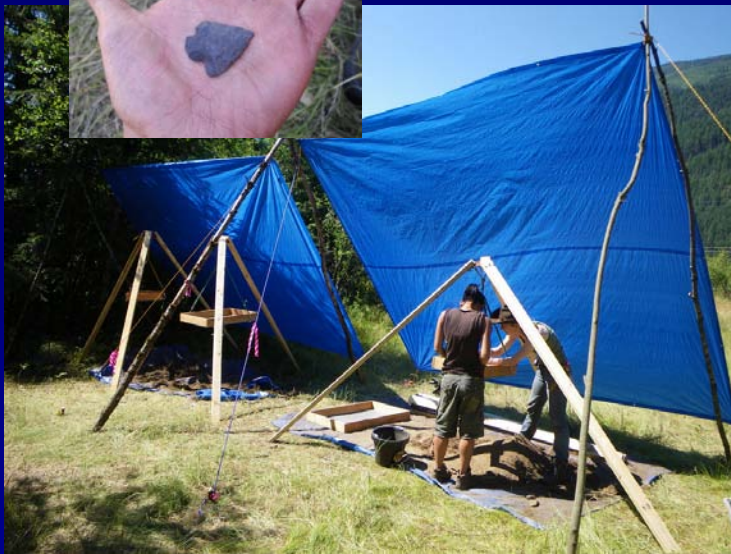
Temperatures were very high, but all excavated materials were carefully screened and sorted.