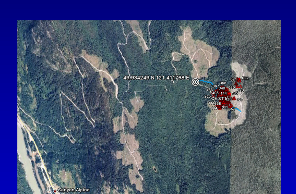
Fieldwork took place at a very large and well preserved culturally modified tree site in the South Ainslie watershed.