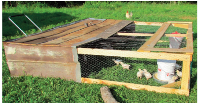
Figure B1. Chicken tractor design with recycled tin roofing