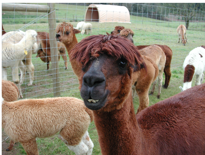
Figure 2. Nutrient concentrations and availability in manure varies widely depending on the type of livestock and how the manure is stored and handled.

Not knowing the nutrient content of manure can lead to large errors in nutrient application rates. We strongly advise you test the manure you plan to use (Figure 2). If you buy manure from a commercial source, they should be able to provide you with nutrient test values; you would not need to do further testing. In the absence of test values, use the published values in Table 2 (manure) and Table 3 (manure composts) as a starting point. For other organic amendments, use the values in Table 4.