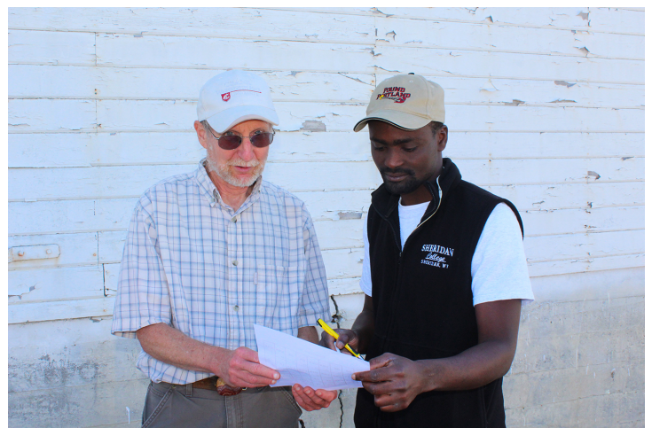
Figure 3. Successful manure testing includes representative sampling, proper sample handling, and knowing how to interpret test results. If you have questions about laboratory reports, contact the lab for clarification.

To convert manure analyses reported on a dry-weight basis (in percentages) to an as-is basis (in lb/wet ton), multiply by 20 to convert the dry-weight percentage to lb/ton; then multiply by the decimal equivalent of the dry matter content.