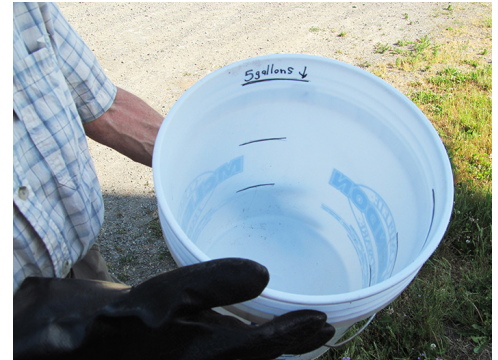
Figure 8. Calibrated bucket to use with dropped bucket method for estimating manure or compost bulk density.