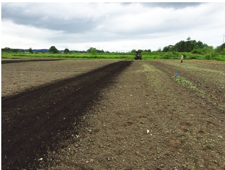
Figure 6. Spreader load calibration method. Determine the area spread from the length and width of the band.

From a nutrient management perspective, the best time to apply manure to row crops is in the spring before planting. Fall application increases the risk of nutrient loss via leaching or runoff. Food safety and soil management impacts of manure application should also be considered.