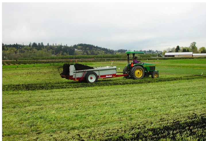
Figure 5. Applying manure compost before spring tillage using a rear-delivery spreader.

There are three general types of solid manure spreaders: rear-delivery, side-delivery, and specialty spreaders. Rear-delivery spreaders work best with drier materials (Figure 5). Side-delivery spreaders handle both wet and dry materials. Specialty spreaders have the capability of spreading material onto narrow beds found in perennial crop production.