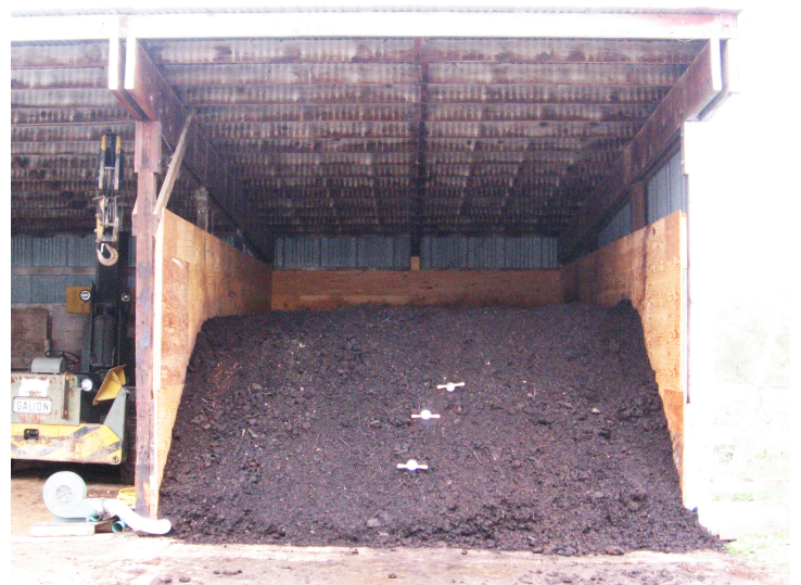
Figure 1. Composting manure on-farm using an aerated, static (unturnd) pile.

What are the benefits and detriments of using uncomposted or composted manure? In some cases, they have comparable properties, and in other ways, they are quite different. Table 1 compares the two materials.