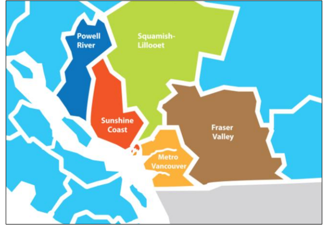
The SWBC Bioregion includes Metro Vancouver, the Fraser Valley, Sunshine Coast, Squamish Lillooet, and Powell River Regional Districts, and the traditional territories of the Coast Salish People

Bioregions are areas that share similar topography, plant and animal life, and human culture. They are largely based on eco-regions but also incorporate human settlement areas, activity patterns, and political boundaries. The SWBC Bioregion includes Metro Vancouver, the Fraser Valley, Sunshine Coast, Squamish Lillooet, and Powell River Regional Districts, and the traditional territories of the Coast Salish People.