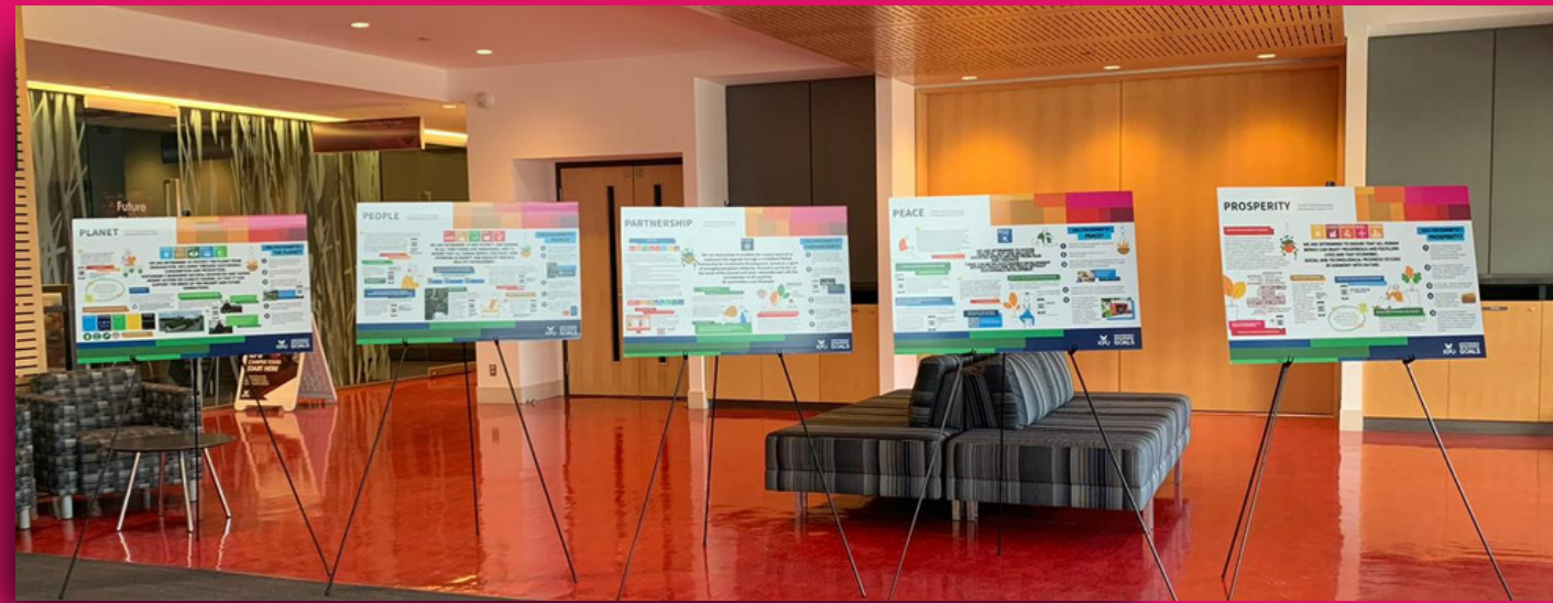
INTERACTIVE SDG LITERACY POSTER GALLERY