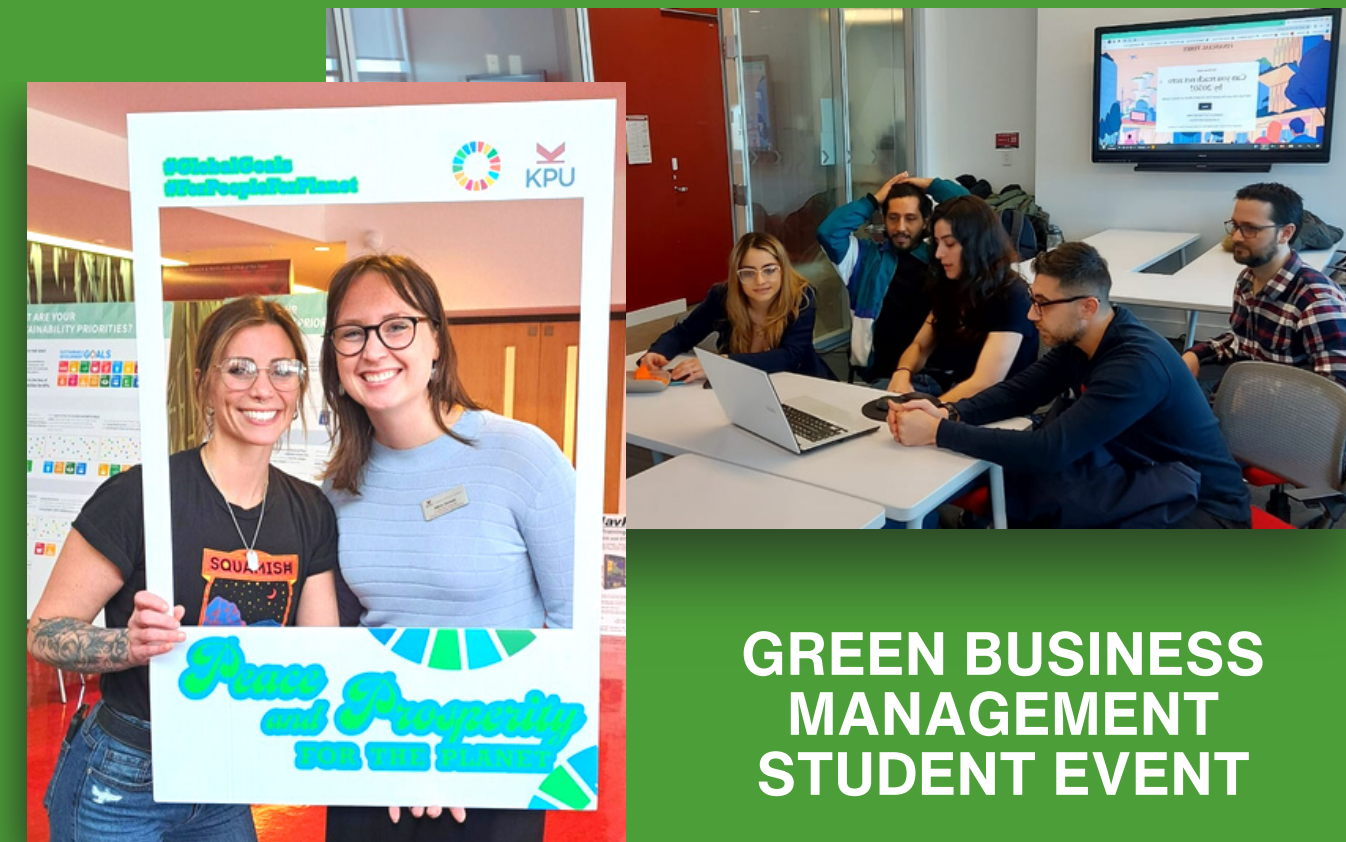
GREEN BUSINESS MANAGEMENT STUDENT EVENT