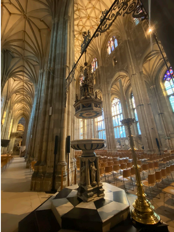
Interior of Cathedral