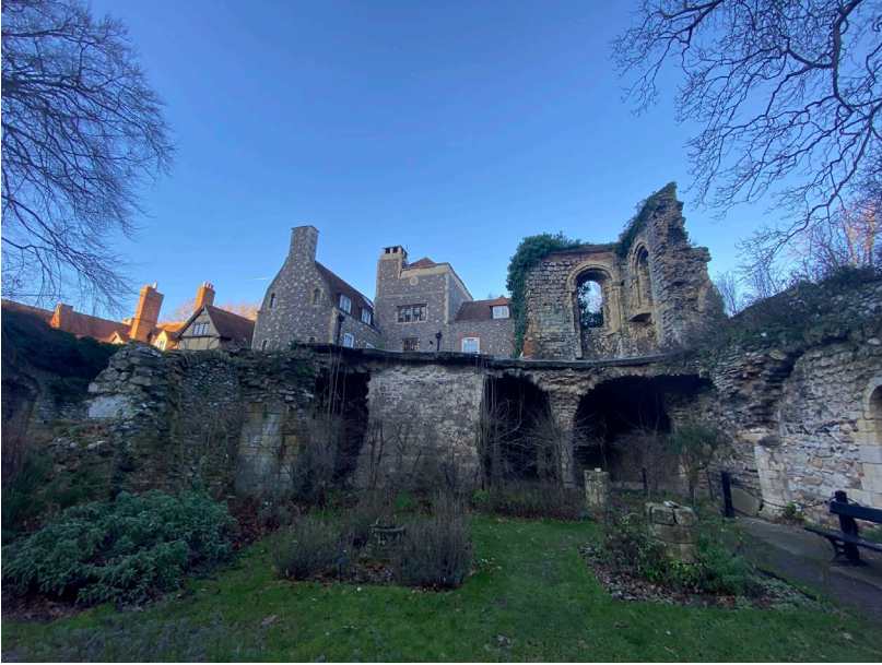
Canterbury Cathedral Gardens