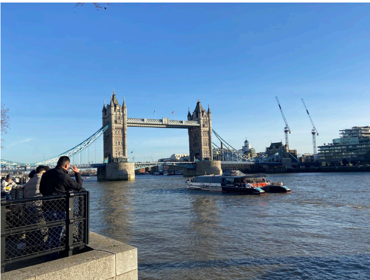
Tower Bridge London