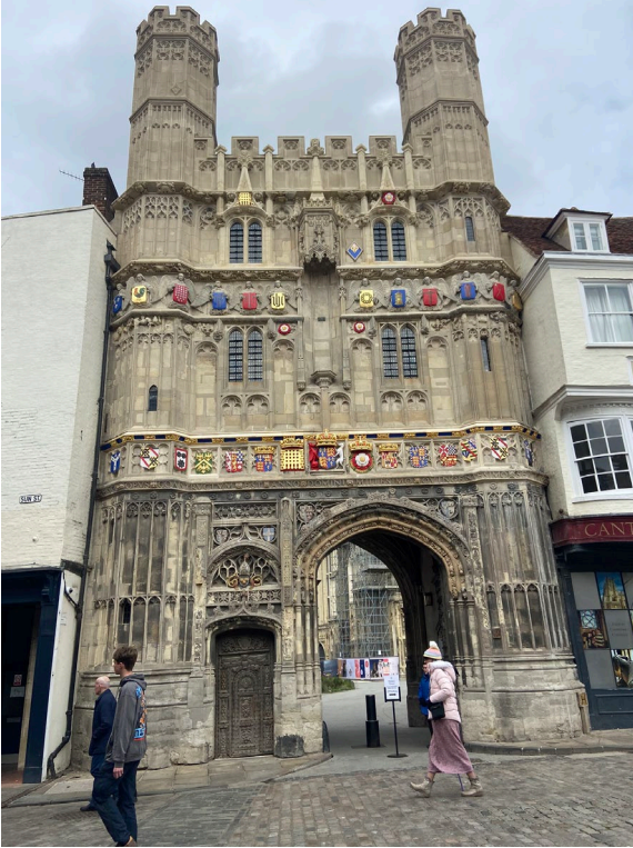
Canterbury Cathedral Gates