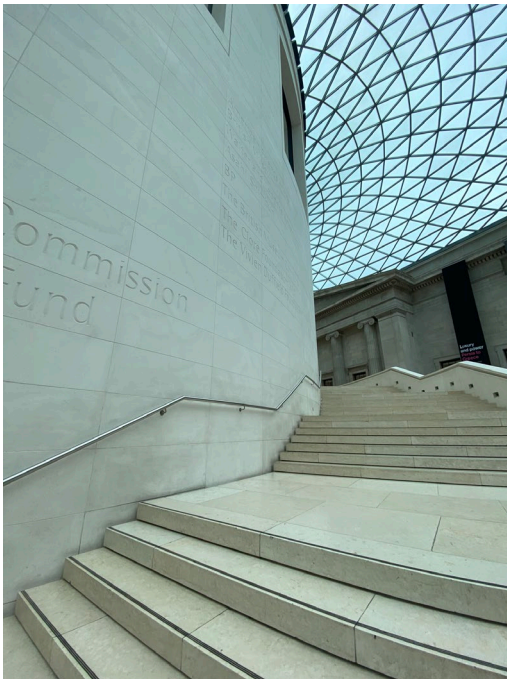
British Museum London