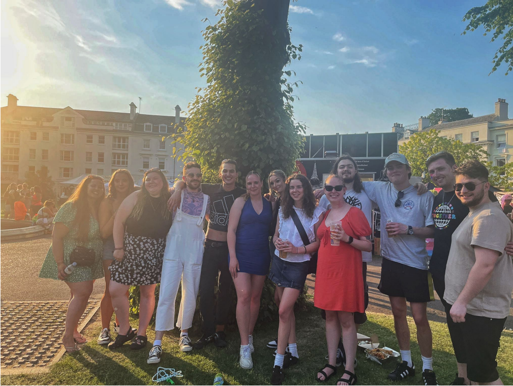
Me (coral dress) and my friends from school