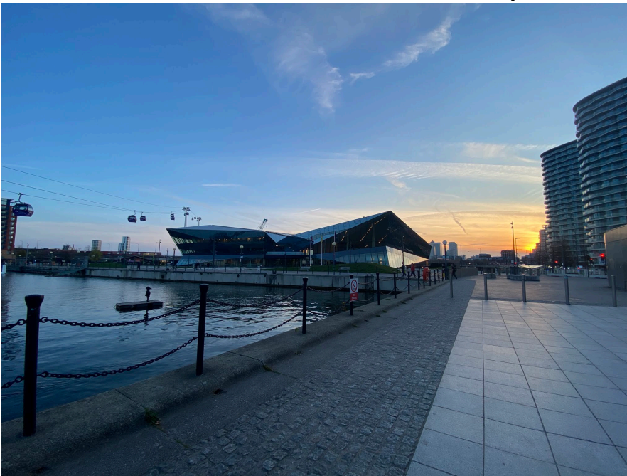
London City Hall