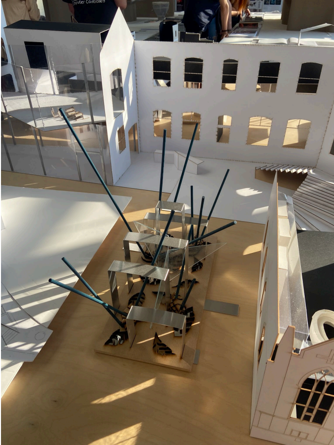
Models I completed through term