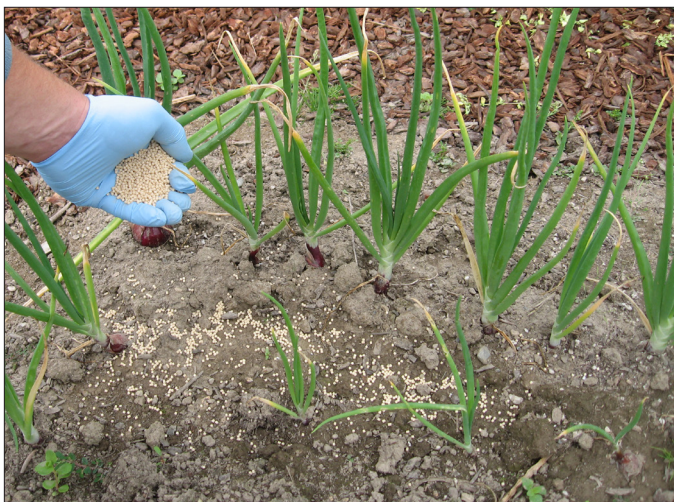
Figure 4. Slug bait pellets containing iron phosphate applied to onions.

Iron Phosphate. Iron phosphate is very effective at managing slugs and snails when combined with bait. Baited iron phosphate usually comes in pellet form. Scatter the product around the crop in need of protec-