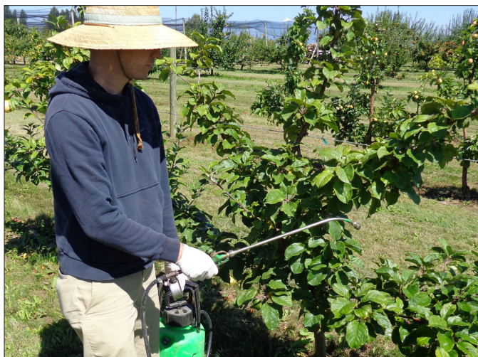
Figure 2. Summer oil sprayed on fruiting apple trees.

ther summer or winter; however, the concentration used in summer is far lower than in the winter. To use summer or dormant oils, first dilute with water. (Commercial oil products contain emulsifying agents that allow them to mix easily with water.) Pests rarely develop resistance to oil sprays, and the products cause little or no harm to most beneficial insects (Raupp et al. 1992). When oils are used correctly (as directed on the label), they are not hazardous to human health.