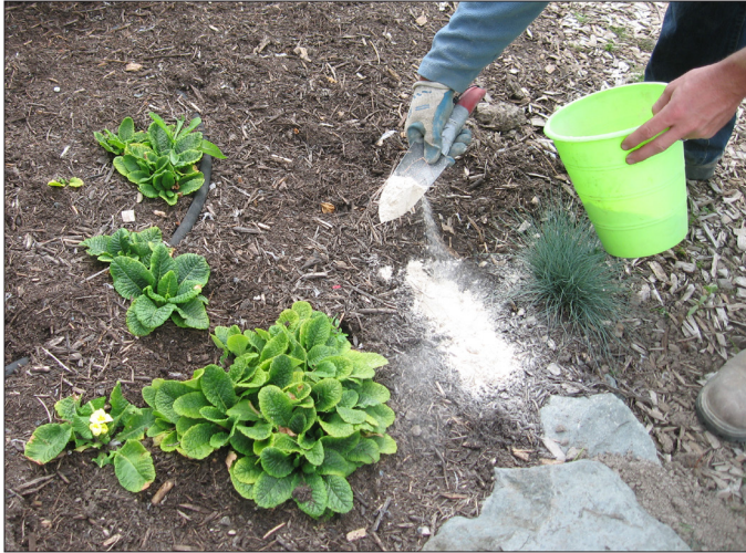
Figure 3. Diatomaceous earth used on nonedible Primula (primrose).

Elemental Sulfur. Elemental sulfur is a finely ground powder that can be applied either as a dust or a spray. This mineral is one of the oldest pesticides known, and reported pest resistance is rare. Sulfur acts as a metabolic disruptor (interferes with a chemical reaction, digestion, or the transport of substances into or between cells) to insects such as aphids, thrips, and spider mites. Most sulfur formulations have low toxicity to people but can be an eye and skin irritant. Sulfur is highly toxic to fish, so it is important to keep it away from water (ExToxNet n.d.).