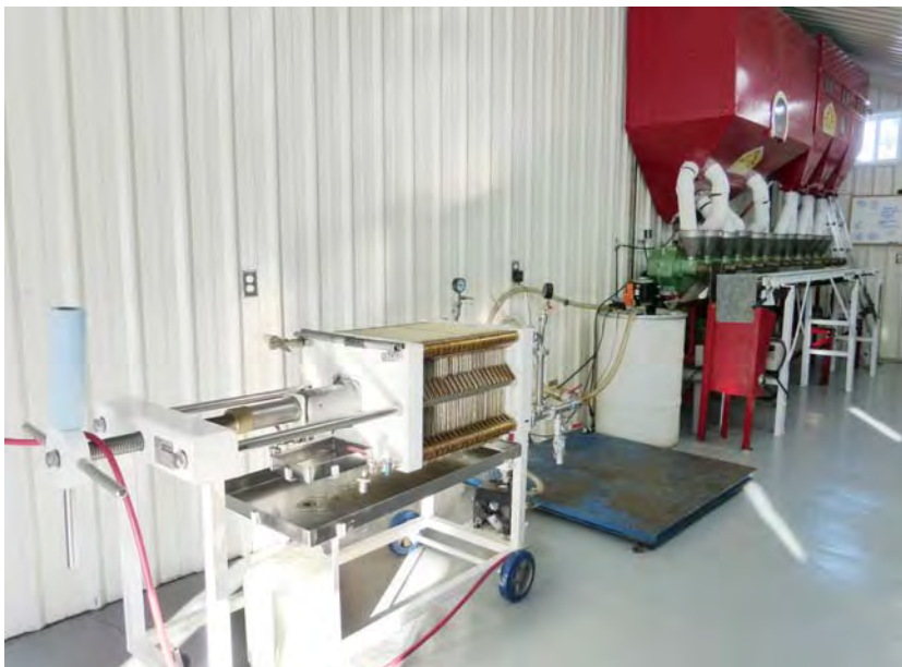
The filter press (foreground) screens out impurities and debris left in the oil after crushing by the presses.

The Oil Barn sells 16-ounce and 24-ounce bottles of safflower oil. Wilkerson says that the retail line is intended to build brand visibility as well as be another income stream for