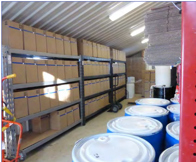
These safflower oil containers are stored in a cool, dry, north-facing building to maximize the oil's shelf life.

Seed meal is a valuable by-product of pressing oilseeds. Sesame seed cake is valuable as a human food. Sunflower seed cake is not suitable for people, but it makes a good addition to chicken, pig,