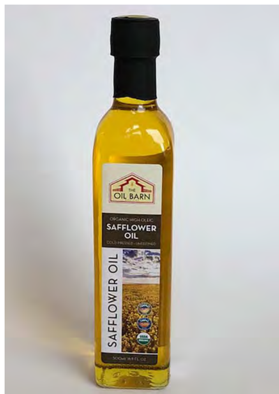
Safflower oil.

Most oil processing in the United States is done on a large industrial scale. Small-scale oil extraction is more commonplace in other parts of the world. As a result, many of the useful resource materials and much of the appropriate-scale machinery come from other countries. This publication describes the basic processes of oilseed production, with extensive sources for additional information and equipment.