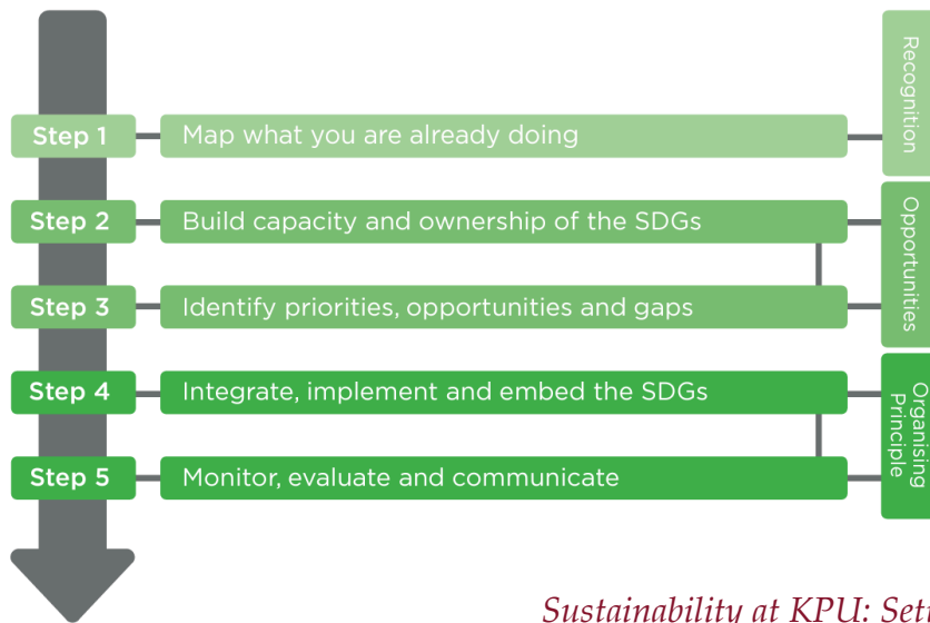
Figure 1. Overview of the SDG integration process.