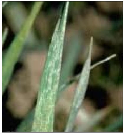
Figure 1.—Gray-silvery cast to wheat leaves damaged by winter grain mite.

B. Tuck, M. Bohle, A. Dreves, and G. Fisher