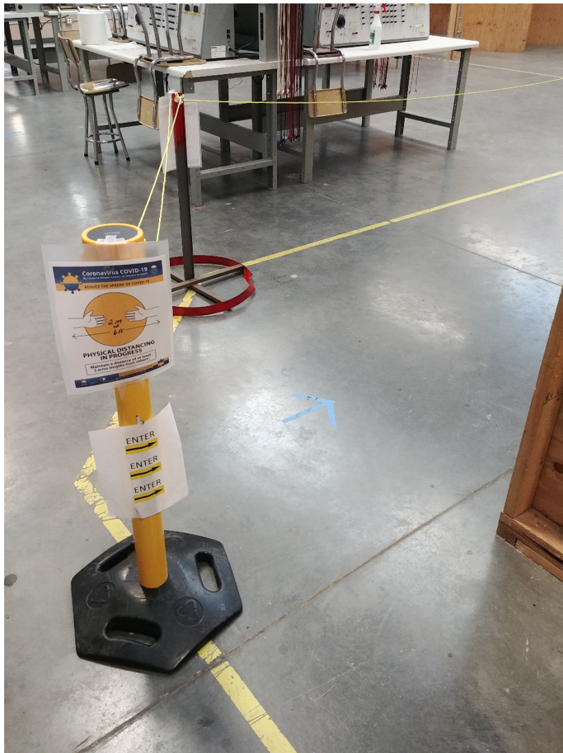
Signage for pedestrian flow.