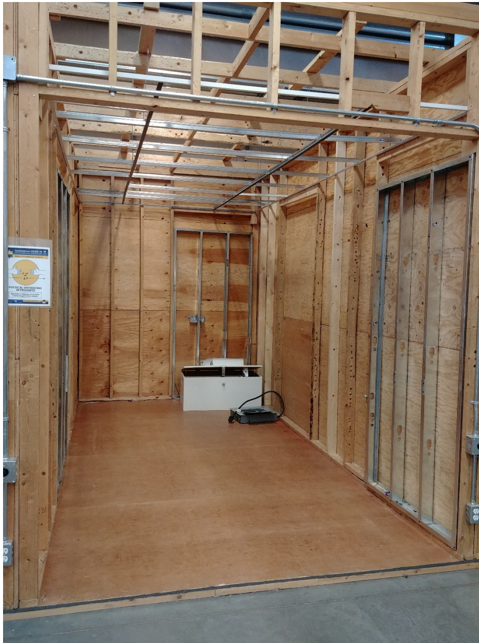
Contained student project areas. Three walls are solid.