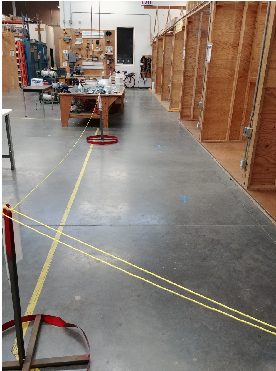
Pedestrian flow with floor markings