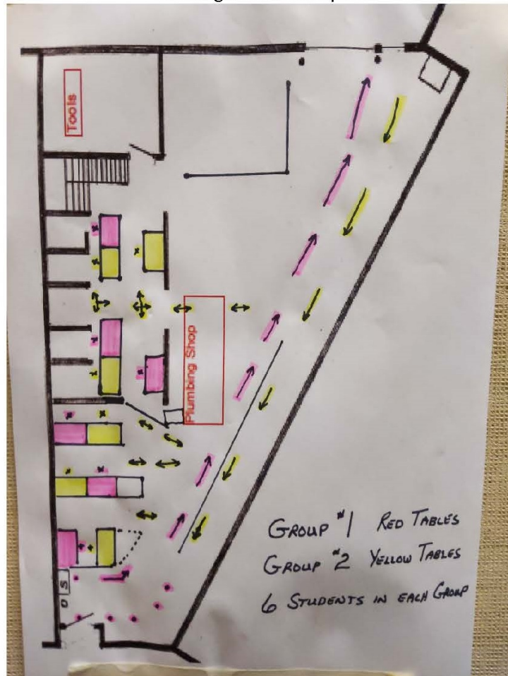
An image of the floorplan