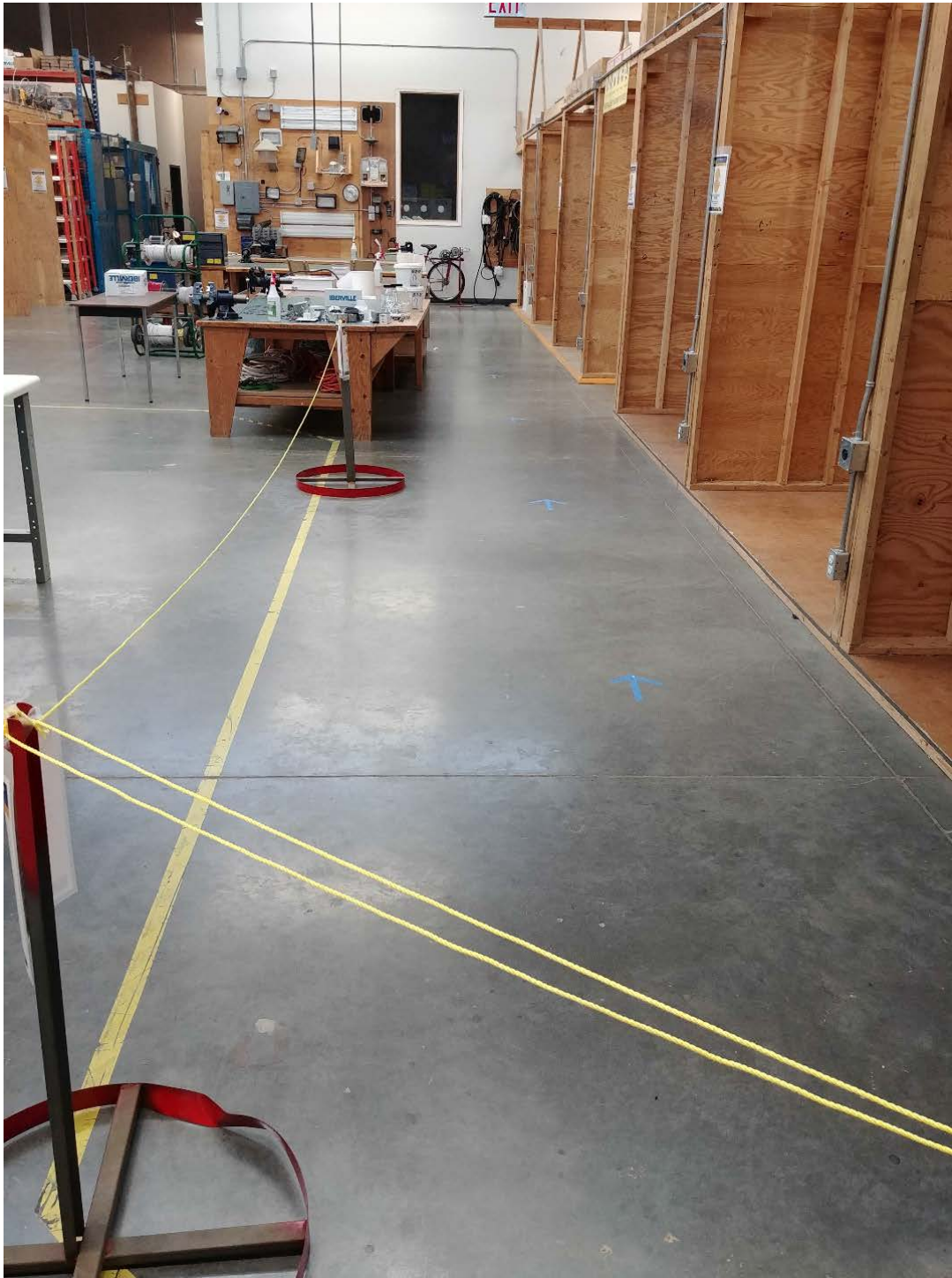
Pedestrian flow with floor markings