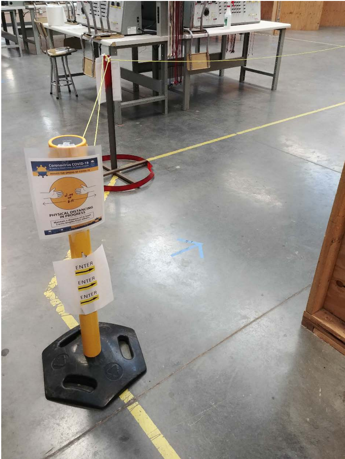
Signage for pedestrian flow.