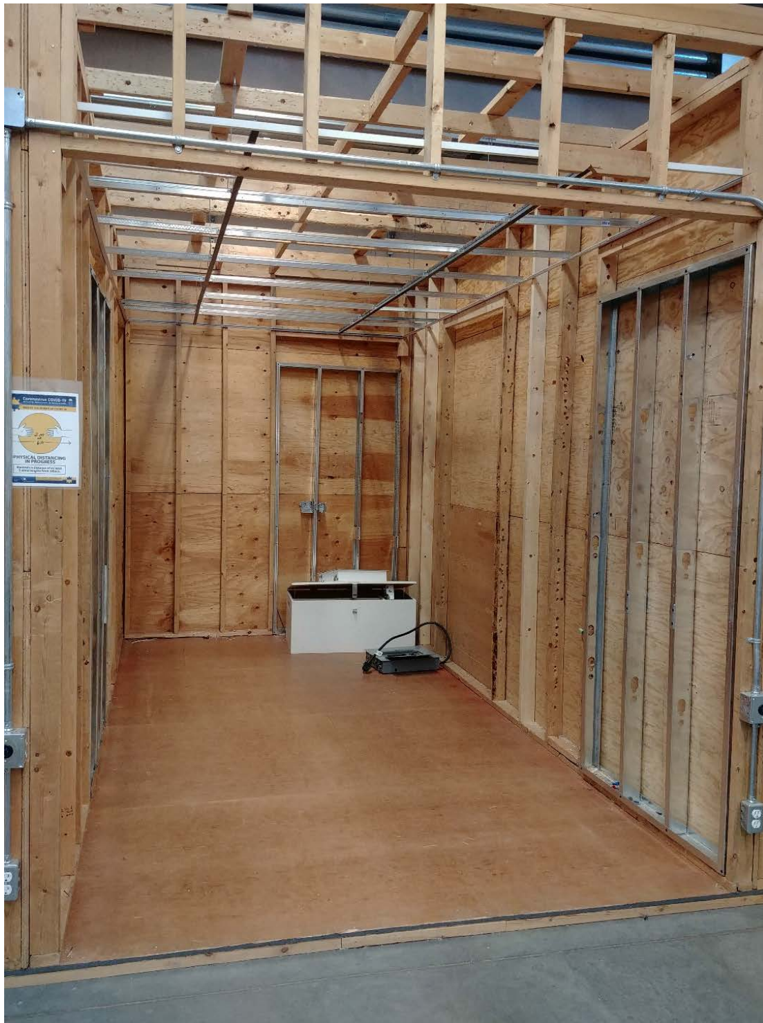
Contained student project areas. Three walls are solid.