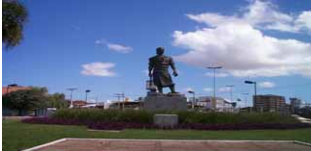
"Laçador" Rio Grande do Sul Landmark