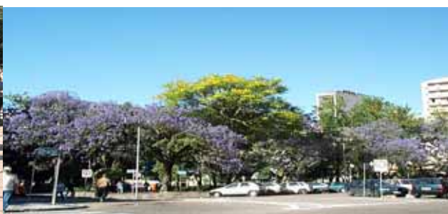
"Praça da Matriz"