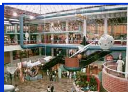
Museum of Science and Technology