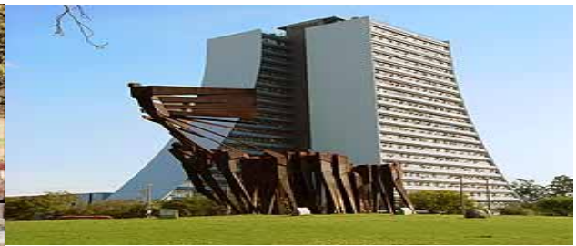
State Administrative Building