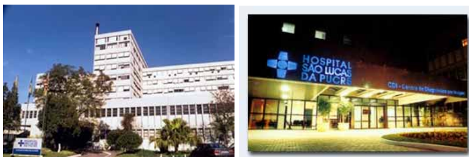
São Lucas Hospital