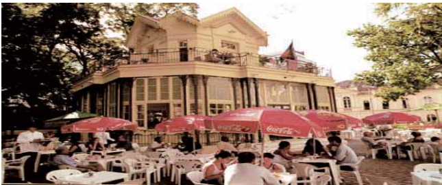
"Chalé da Praça XV"