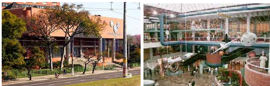
Museum of Science and Technology

It has a 12,000 sqmt exhibition area, and aims at fostering curiosity and enjoyment for this sciences, showing natural phenomena and man-world relationships in a new and exciting fashion. It features 700 different scientific experiments.