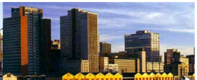
"Cais do Porto" Harbour